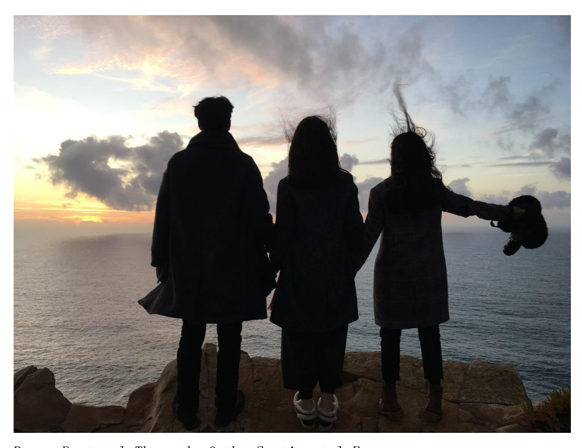
Roca, Portugal The end of the Continental Europe