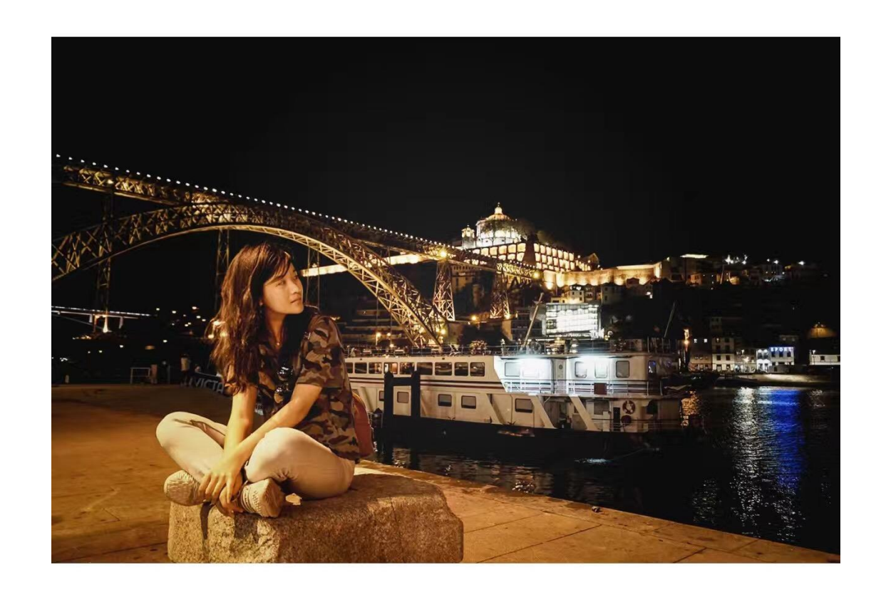
Trip to Porto, Portugal

Thanks to Erasmus, it's an excellent experience of studying and trip for me.