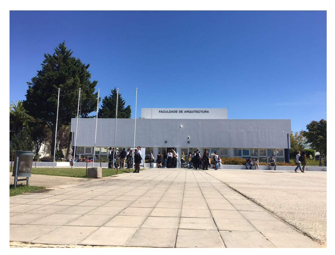
Faculty of architecture, University of Lisbon