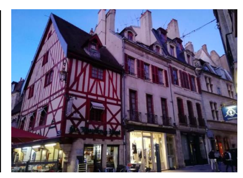
Campus of Burgundy School of Business