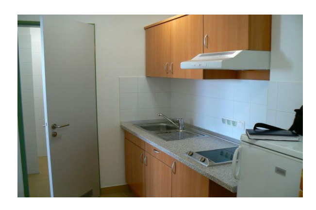
Building "A" kitchen