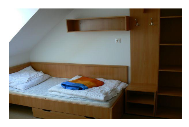
Part of the bedroom

The kitchens are equipped with a fridge and a cooker. WIFI is provided throughout the whole dormitory. (You can only access it with the NEPTUN code you receive from the university after you finalise your registration at your faculty.)