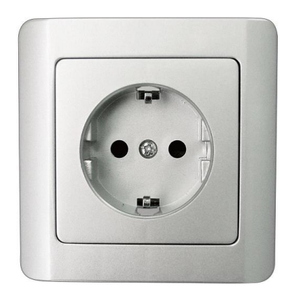
Standard power socket