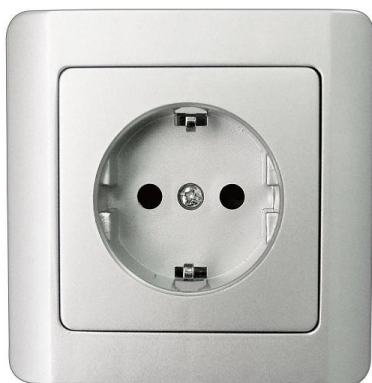
Standard power socket