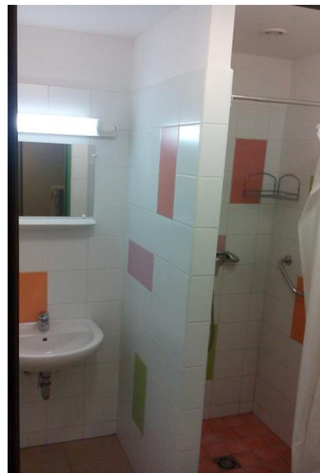
Building „A” bathroom