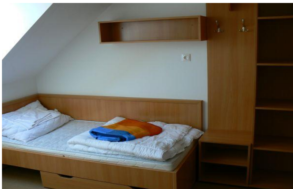
Part of the bedroom

The kitchens are equipped with a fridge and a cooker. WIFI is provided throughout the whole dormitory. (You can only access it with the NEPTUN code you receive from the university after you finalise your registration at your faculty.)