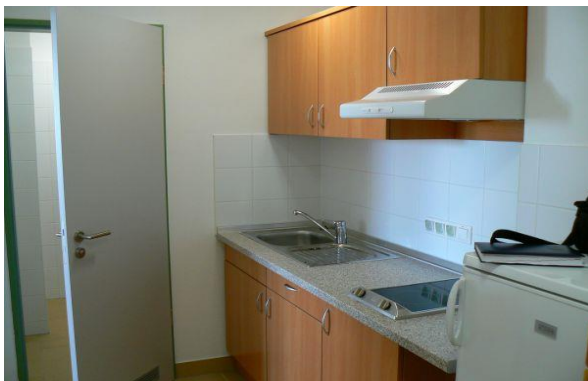
Building „A” kitchen