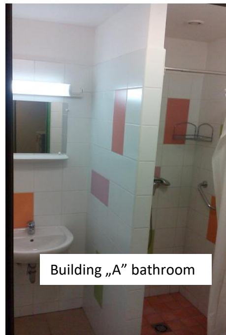
Building „A” bathroom