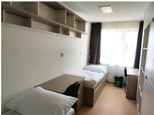
Part of the bedroom

WIFI is provided throughout the whole dormitory. (You can only access it with the NEPTUN code you receive from the university after you finalise your registration at your faculty.)