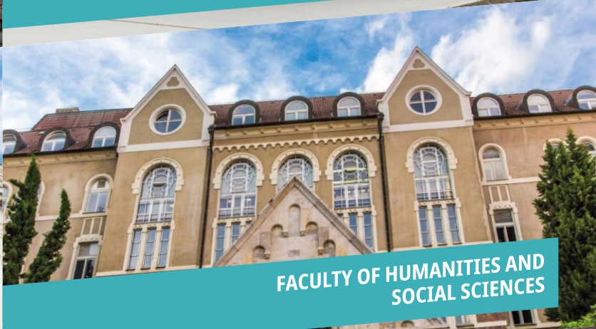
FACULTY OF HUMANITIES AND SOCIAL SCIENCES