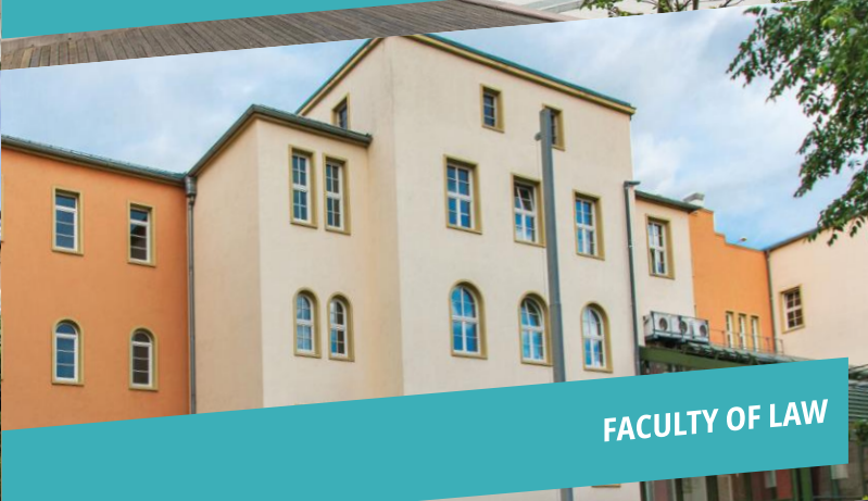
FACULTY OF LAW