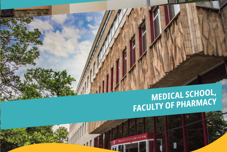
MEDICAL SCHOOL, FACULTY OF PHARMACY