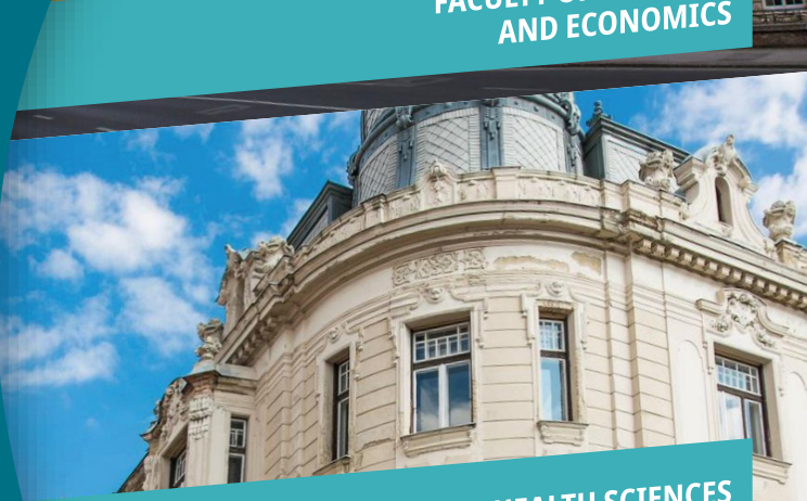
FACULTY OF HEALTH SCIENCES