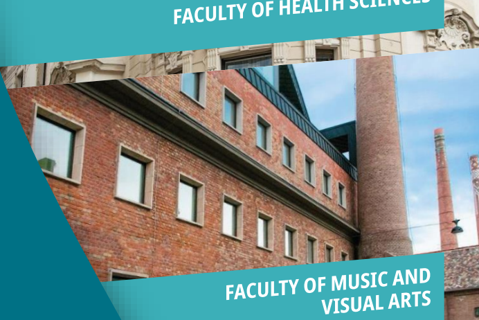
FACULTY OF MUSIC AND VISUAL ARTS