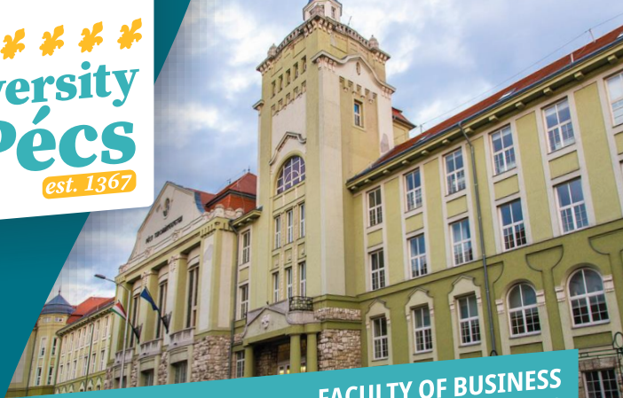
FACULTY OF BUSINESS AND ECONOMICS