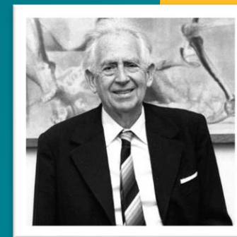
János Szentágothai (1912–1994) Neurobiologist, Brain scientist, Professor of anatomy at UP