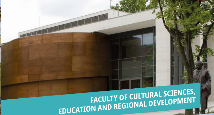
FACULTY OF CULTURAL SCIENCES, EDUCATION AND REGIONAL DEVELOPMENT