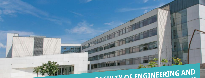
FACULTY OF ENGINEERING AND INFORMATION TECHNOLOGY