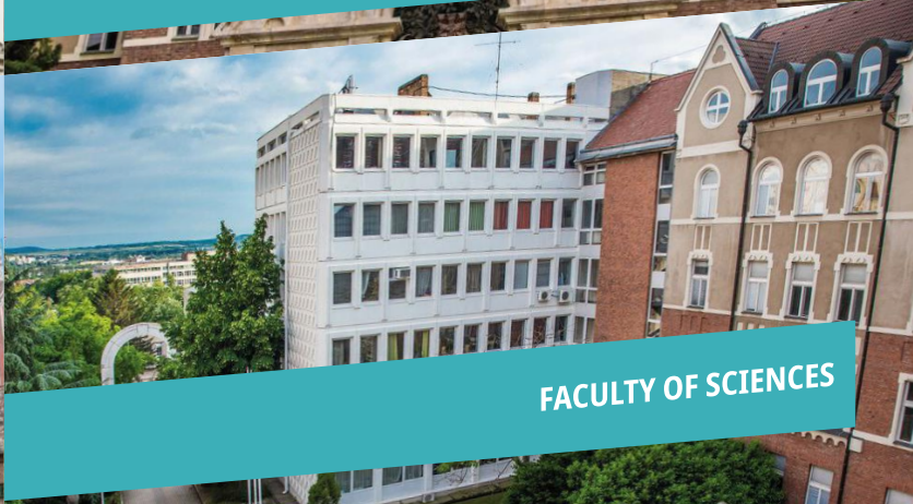
FACULTY OF SCIENCES