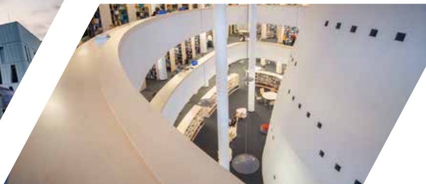
← Szentágothai Research Centre