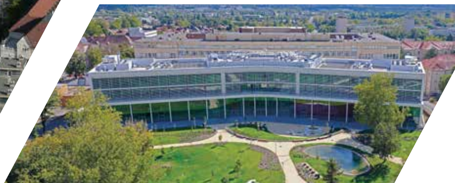
← Faculty of Humanities and Social Sciences and Faculty of Sciences