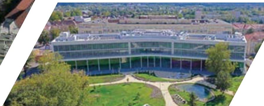
← Faculty of Humanities and Social Sciences and Faculty of Sciences