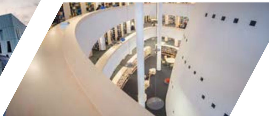
← Szentágothai Research Centre